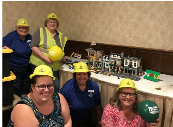
2022 National Payroll Week "Building Blocks of America" Celebration

Chapter Members pictured from left to right: